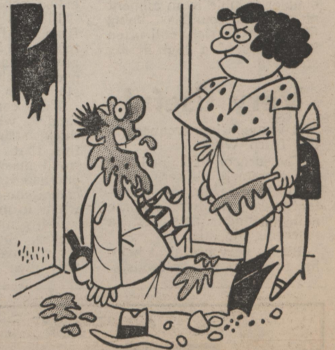
"Mmm! Delicious — just like mum used to throw at dad!"