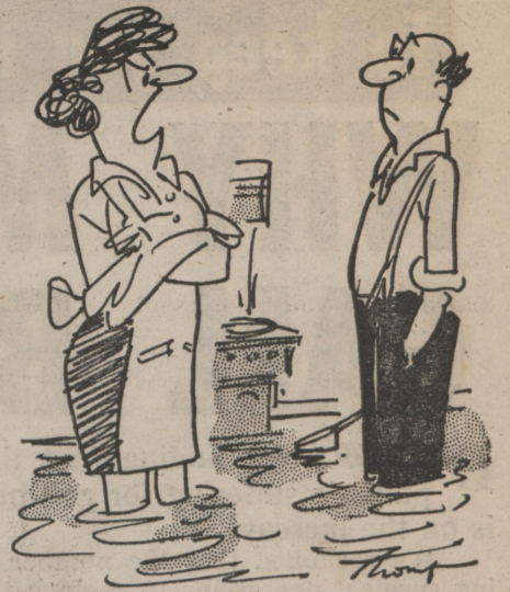
"Send for a plumber? But you ARE a plumber!"

She's married to an advertising executive and the couple have an infant daughter.