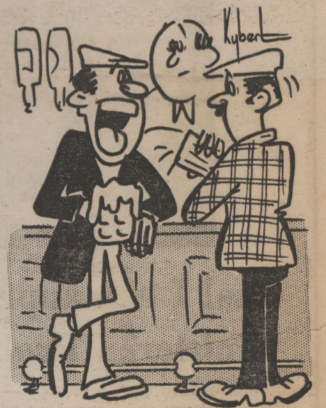
"My brother was an army karate expert until he killed himself saluting!"